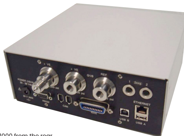
PACE1000 from the rear