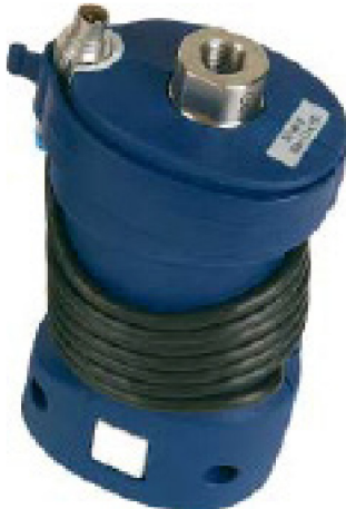
External IDOS universal pressure module

*Provides absolute pressure option in addition to gauge pressure. In absolute mode adds barometric pressure to gauge pressure range. For absolute mode ranges below 1 bar please consult your sales representative.