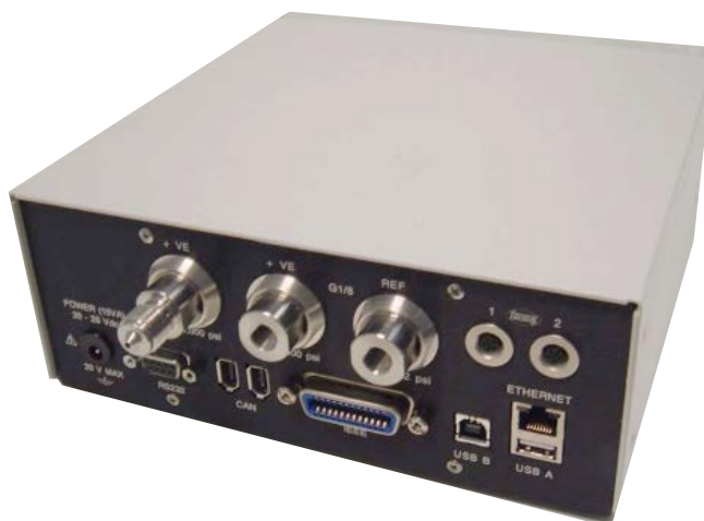
PACE Tallis from the rear

Tallis will be supplied with appropriate standard compliance labelling (STD). Additional regional specific labelling may also be made available as required