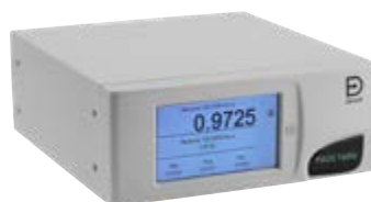
PACE Tallis Transfer Standard Calibrator

All sensors can be calibrated or checked at the same time through a connection to the Pt port on the unit. With this simple intuitive process calibration of the ADTS550F takes a matter of minutes.