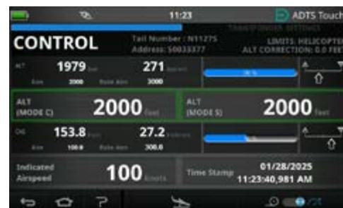
ADTS Touch ADS-B control screen