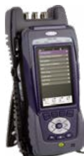
Viavi AVX-10K Flight line

This patented functionality offers clear time savings and efficiency improvements to aircraft maintenance operations. Requires AA500F-50 and AAADS-B accessories.